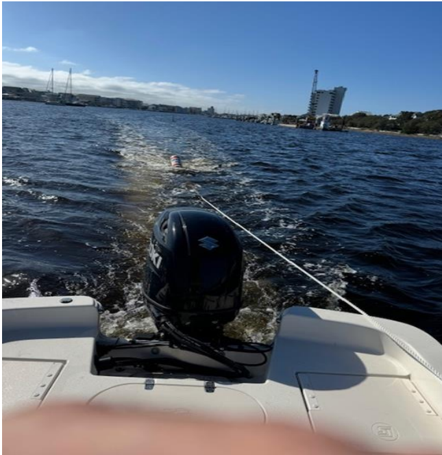
Mooring field marker broke loose and was removed for repairs