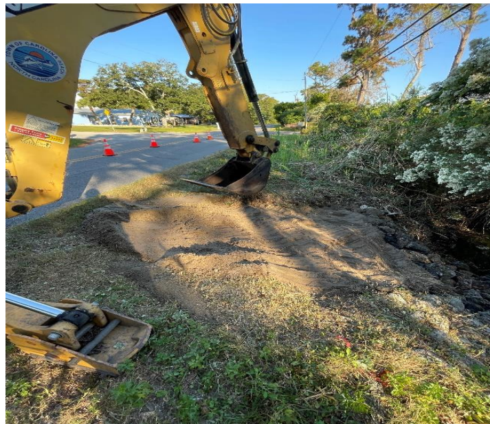
Crews repaired a washout on St. Joseph Street