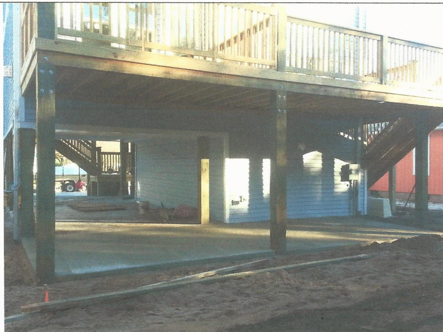
Rear View (Photo taken January 14, 2016)

If submitting more photographs than will fit on the preceding page, affix the additional photographs below. Identify all photographs with: date taken; "Front View" and "Rear View"; and, if required, "Right Side View" and "Left Side View." When applicable, photographs must show the foundation with representative examples of the flood openings or vents, as indicated in Section A8.