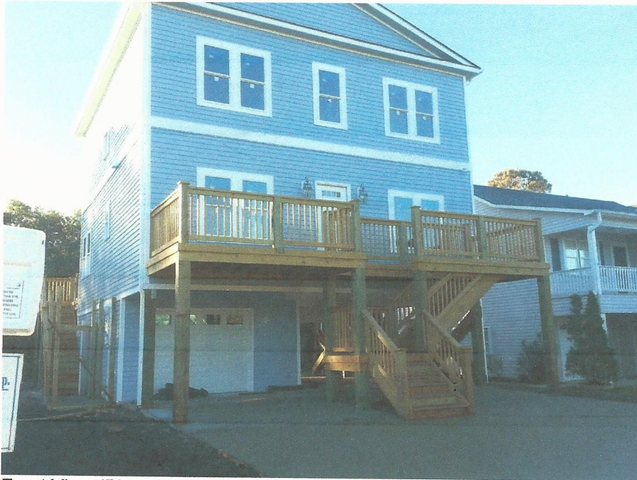
Front View (Photo taken January 14, 2016)

If using the Elevation Certificate to obtain NFIP flood insurance, affix at least 2 building photographs below according to the instructions for Item A6. Identify all photographs with date taken; "Front View" and "Rear View"; and, if required, "Right Side View" and "Left Side View." When applicable, photographs must show the foundation with representative examples of the flood openings or vents, as indicated in Section A8. If submitting more photographs than will fit on this page, use the Continuation Page.