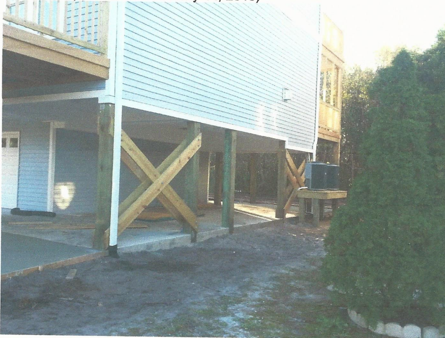
Right Side View (Photo taken January 14, 2016)