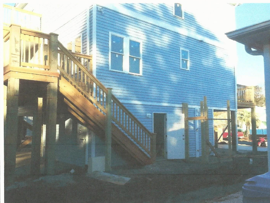
Left Side View (Photo taken January 14, 2016)