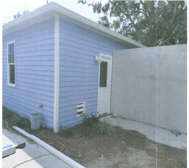
GARAGE - REAR VIEW