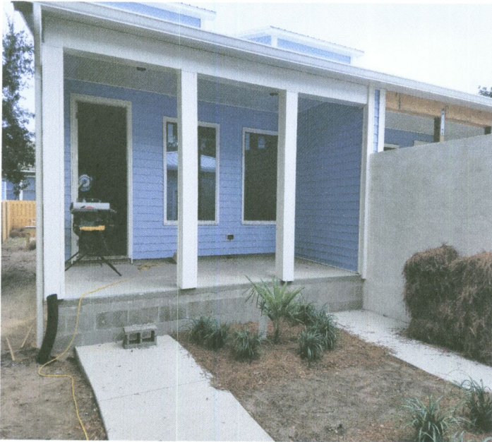
PHOTOS TAKEN AUGUST 31, 2016 & SEPTEMBER 12, 2016 FRONT VIEW REAR VIEW

If using the Elevation Certificate to obtain NFIP flood insurance, affix at least 2 building photographs below according to the instructions for Item A6. Identify all photographs with date taken; "Front View" and "Rear View"; and, if required, "Right Side View" and "Left Side View." When applicable, photographs must show the foundation with representative examples of the flood openings or vents, as indicated in Section A8. If submitting more photographs than will fit on this page, use the Continuation Page.