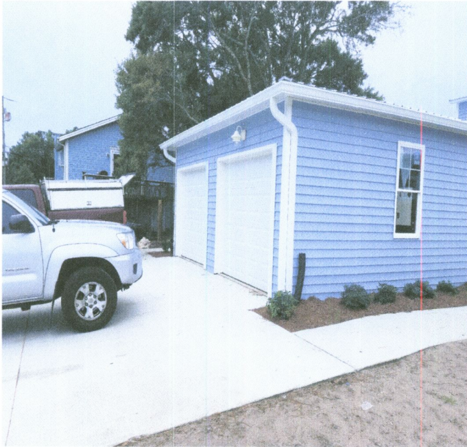
GARAGE - FRONT VIEW