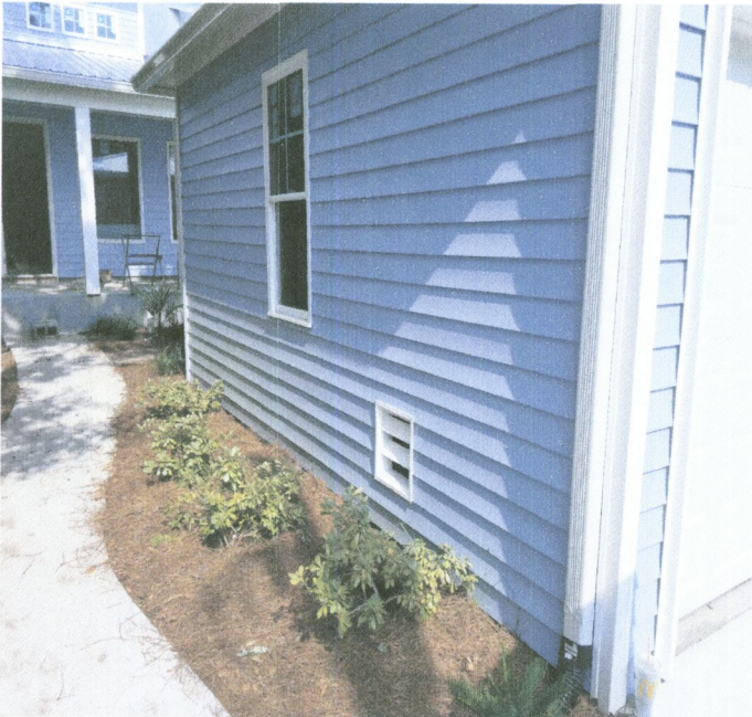
GARAGE - LEFT SIDE VIEW