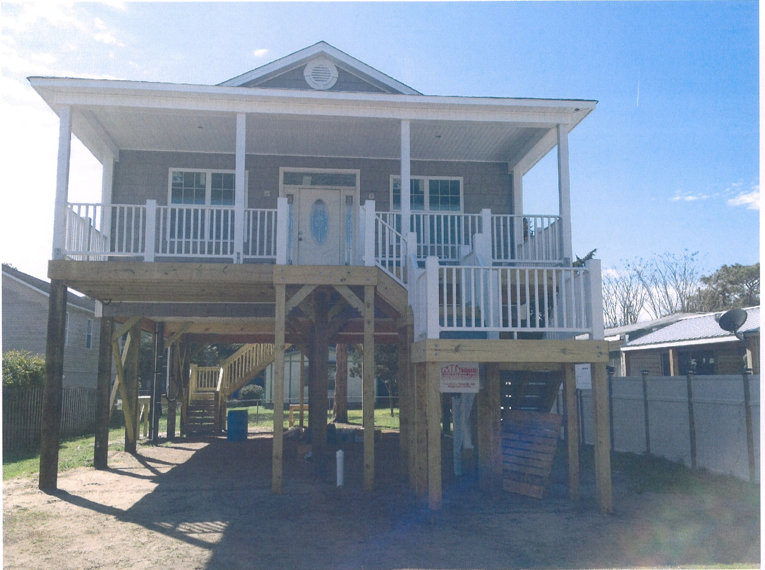
Front View 03/27/2015

Building Street Address (including Apt., Unit, Suite, and/or Bldg. No.) or P.O. Route and Box No. 215 Goldsboro Avenue