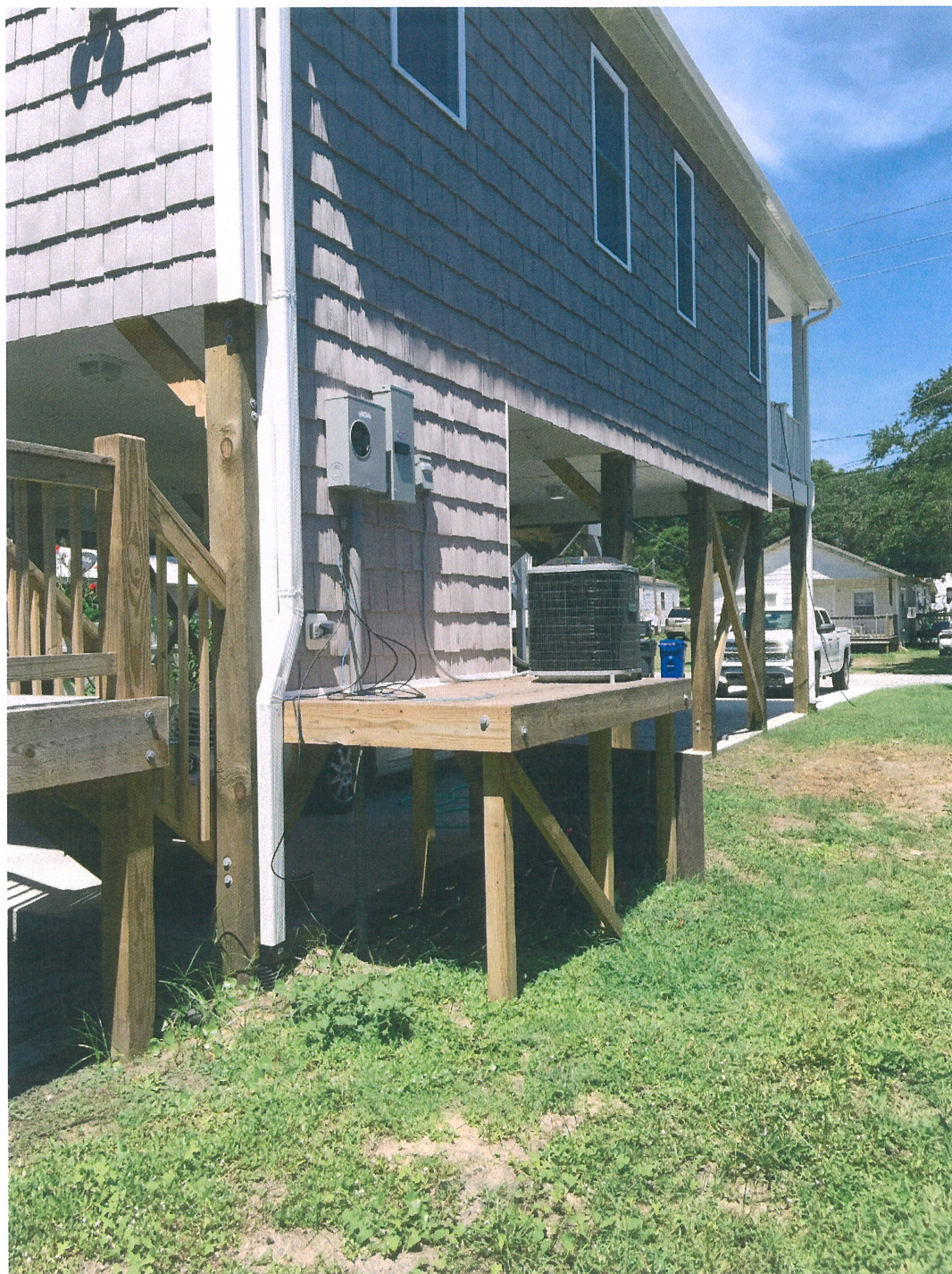
Rear View 08/23/2015

If submitting more photographs than will fit on the preceding page, affix the additional photographs below. Identify all photographs with: date taken; "Front View" and "Rear View"; and, if required, "Right Side View" and "Left Side View." When applicable, photographs must show the foundation with representative examples of the flood openings or vents, as indicated in Section A8.