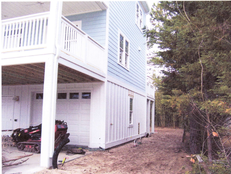
Right Side View (Photo taken March 6, 2015)