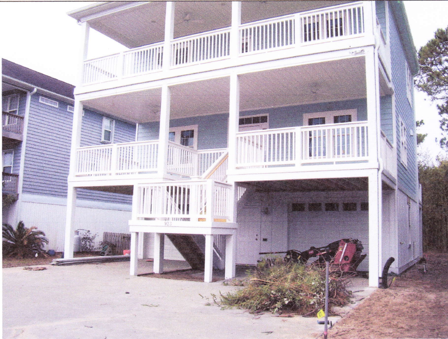
Front View (Photo taken March 6, 2015)

If using the Elevation Certificate to obtain NFIP flood insurance, affix at least 2 building photographs below according to the instructions for Item A6. Identify all photographs with date taken; "Front View" and "Rear View"; and, if required, "Right Side View" and "Left Side View." When applicable, photographs must show the foundation with representative examples of the flood openings or vents, as indicated in Section A8. If submitting more photographs than will fit on this page, use the Continuation Page.