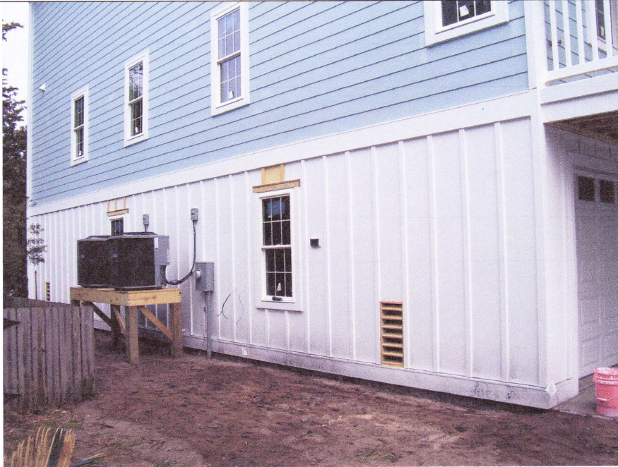
Left Side View (Photo taken March 6, 2015)

If submitting more photographs than will fit on the preceding page, affix the additional photographs below. Identify all photographs with: date taken; "Front View" and "Rear View"; and, if required, "Right Side View" and "Left Side View." When applicable, photographs must show the foundation with representative examples of the flood openings or vents, as indicated in Section A8.