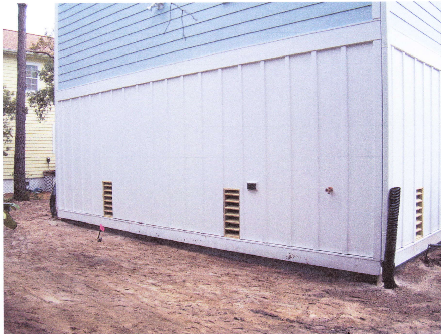
Rear View (Photo taken March 6, 2015)