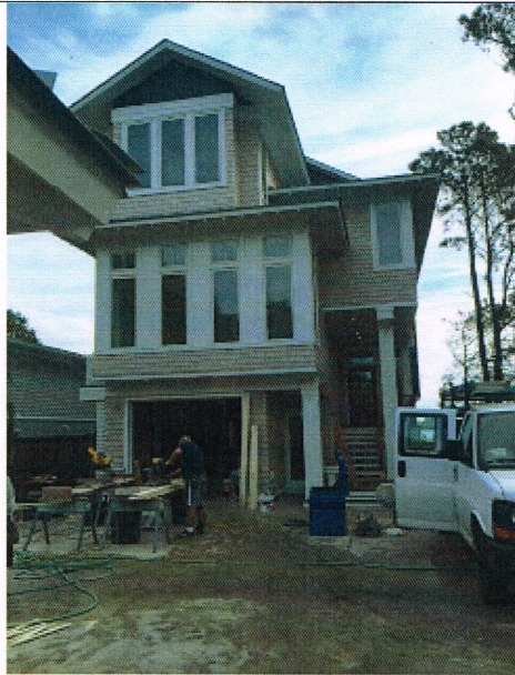
Front of house (western side)

If using the Elevation Certificate to obtain NFIP flood insurance, affix at least 2 building photographs below according to the instructions for Item A6. Identify all photographs with date taken; "Front View" and "Rear View"; and, if required, "Right Side View" and "Left Side View." When applicable, photographs must show the foundation with representative examples of the flood openings or vents, as indicated in Section A8. If submitting more photographs than will fit on this page, use the Continuation Page.