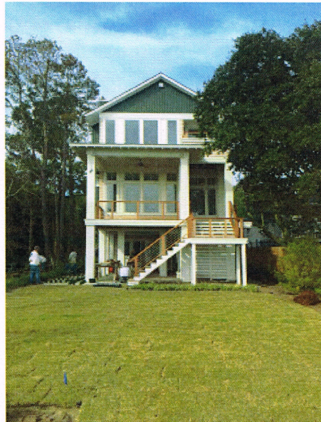
Rear of house (eastern side)