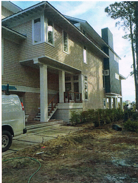
Southern side with elevated foyer