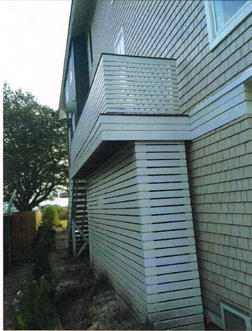
Northern side w/ AC Platform

If submitting more photographs than will fit on the preceding page, affix the additional photographs below. Identify all photographs with: date taken; "Front View" and "Rear View"; and, if required, "Right Side View" and "Left Side View." When applicable, photographs must show the foundation with representative examples of the flood openings or vents, as indicated in Section A8.