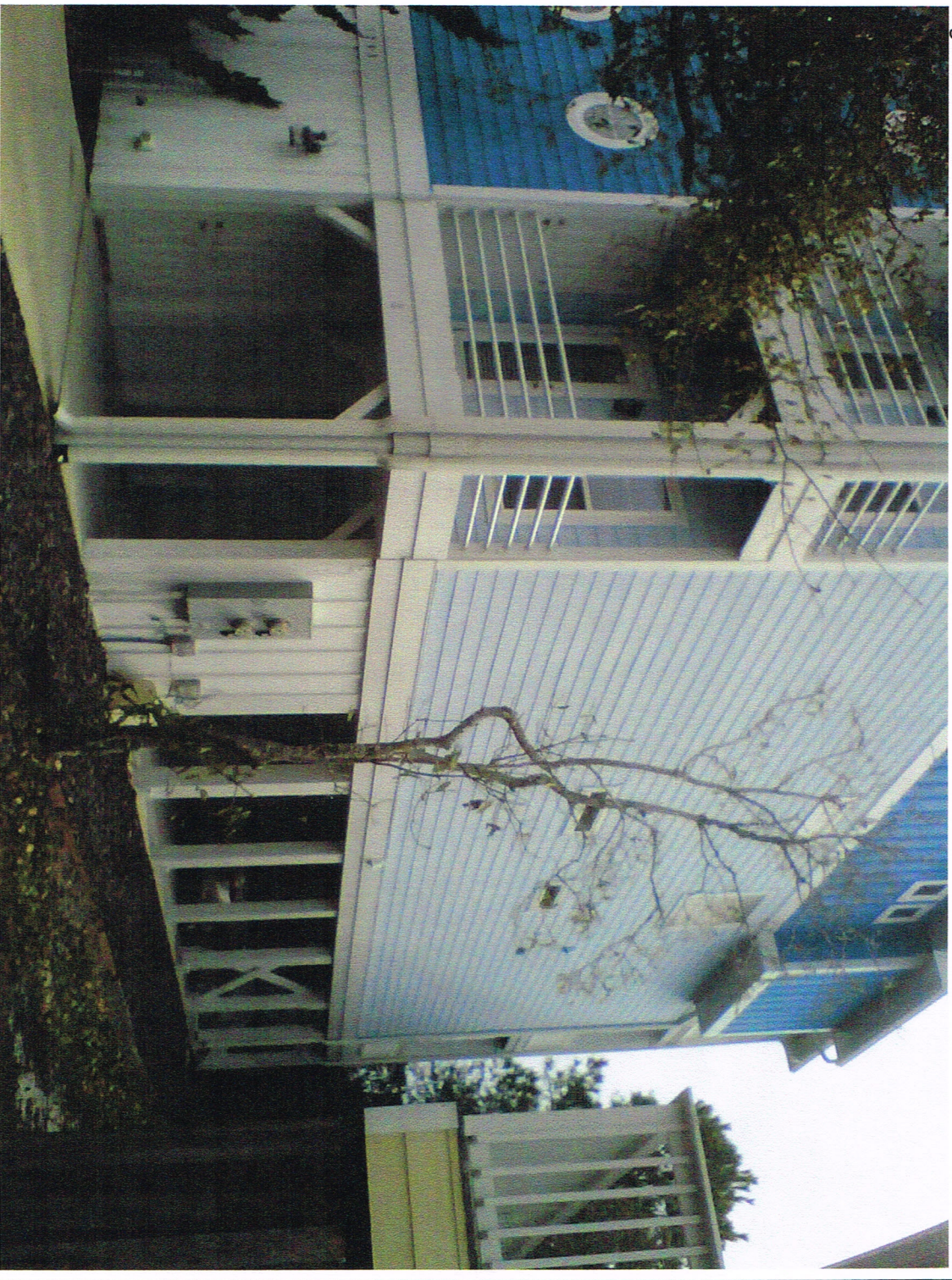
Right Side View – 03/11/13

If submitting more photographs than will fit on the preceding page, affix the additional photographs below. Identify all photographs with: date taken, "Front View" and "Rear View", and, if required, "Right Side View" and "Left Side View." When applicable, photographs must show the foundation with representative examples of the flood openings or vents, as indicated in Section A8.