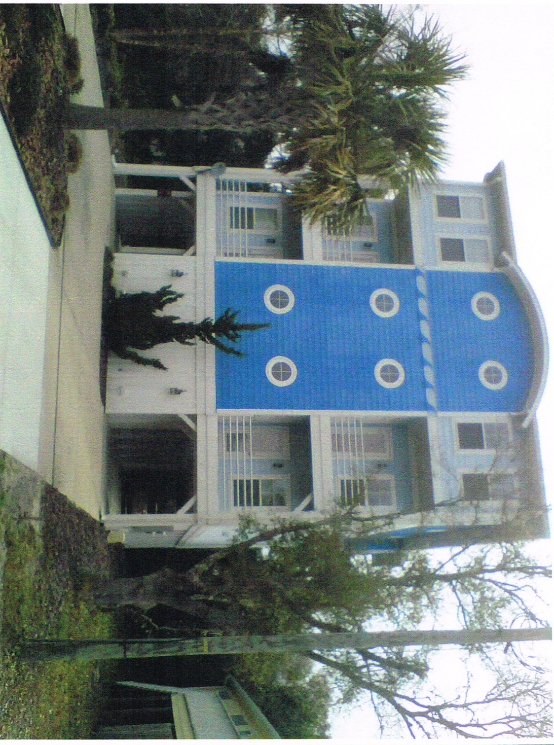
Front View 03/11/13

If using the Elevation Certificate to obtain NFIP flood insurance, affix at least 2 building photographs below according to the instructions for Item A6. Identify all photographs with date taken; "Front View" and "Rear View"; and, if required, "Right Side View" and "Left Side View." When applicable, photographs must show the foundation with representative examples of the flood openings or vents, as indicated in Section A8. If submitting more photographs than will fit on this page, use the Continuation Page.